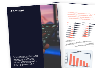
Thought Leadership Pieces