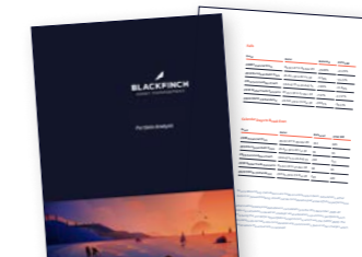
Investment Analysis Reports