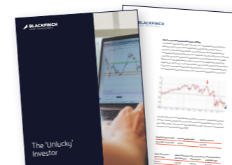
Ad-hoc Market Commentaries

Working with Blackfinch doesn't just mean having access to our products and services though. We want to build deep relationships with adviser firms and support your firms' growth. These are some of the things you can enjoy when you partner with Blackfinch: