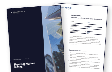
Monthly Market Moves