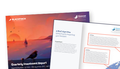
Quarterly Investment Reports